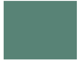
*Emerald Haze M1343