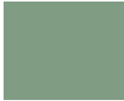
Moss Green M1029