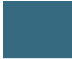
*Lagoon Mist M1547