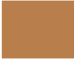
*Leather Brown M1034