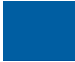
*Crystal Sapphire M1945