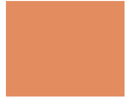
*Arizona Clay M1471