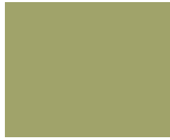
*Olive Green M1041