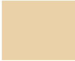
Old Adobe M1072