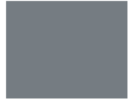
Ember Dust M1432