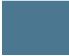
*Cape Cod Blue M1000