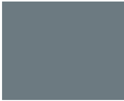
Slate Gray M1432