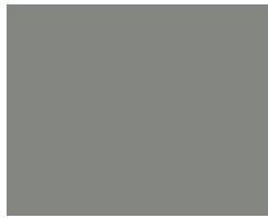
Dover Gray M1095