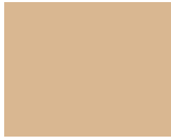
Sandalwood Beige M1043