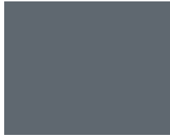
Slate Gray M1432