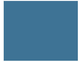
*Oceanic Blue M1955