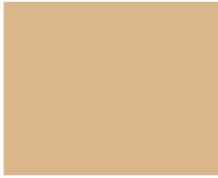
Cognac Haze M1035