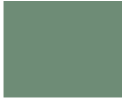
Moss Green M1029