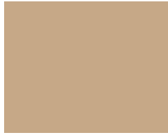
Sandalwood Beige M1043