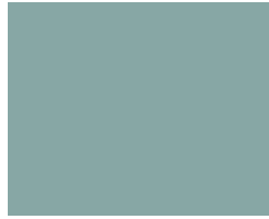
Sea Mist M1030