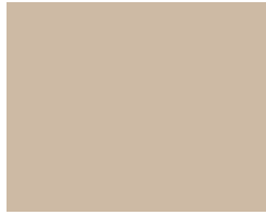
Sand Dune M1055