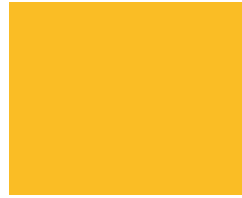
*Sun Blast M1109