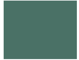
*Emerald Haze M1343