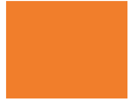
*Orange Lustre M1021