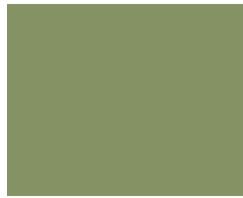
*Olive Green M1041