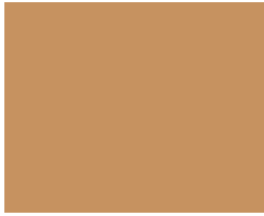
Timber Tan M1005