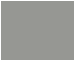
Dover Gray M1095