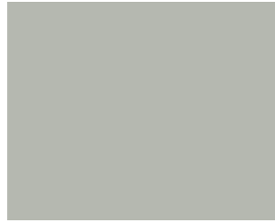
Dove Gray CH011 / AR011