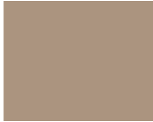
Moss CH008 / AR008