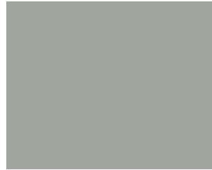
Dove Gray CH011 / AR011