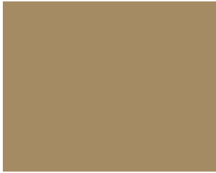
Mocha CH003 / AR003