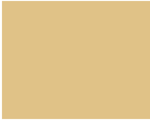
Sandstone CH002 / AR002