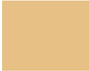
Apricot CH006 / AR006