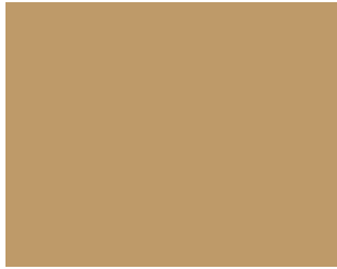
Mocha CH003 / AR003