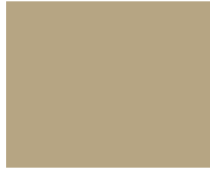
Soapstone CH013 / AR013