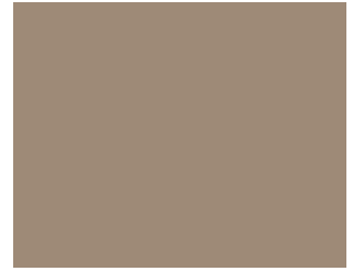
Driftwood CH016 / AR016