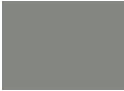
Dover Gray M1095