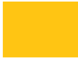
*Sun Blast M1109