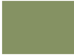
*Olive Green M1041