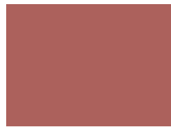
*Canyon Red M1807