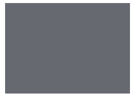
Ember Dust M1432