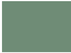
Moss Green M1029