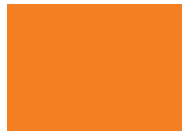
*Orange Lustre M1021