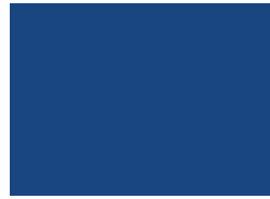
*Crystal Sapphire M1945