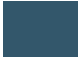
*Lagoon Mist M1547