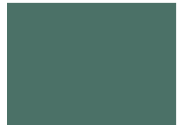
*Emerald Haze M1343