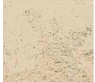
73 Egg Shell