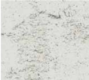
50 Crystal White

Explore colors, patterns, textures and accents to maximize your creative design possibilities!