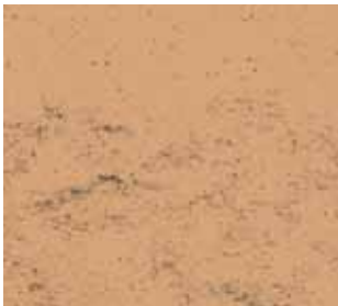
71 Miami Peach