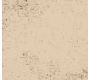
53 Pure Ivory