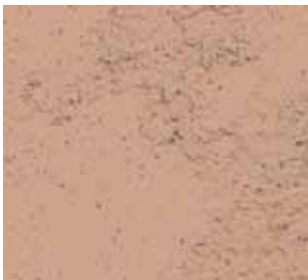
24 Santa Fe