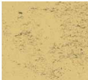
55 French Vanilla